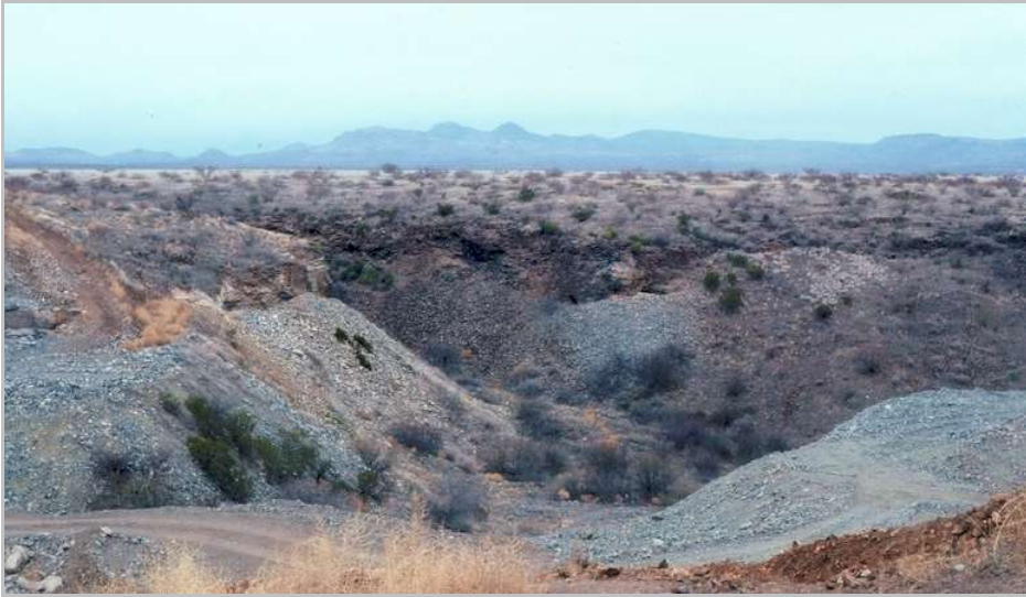
Green rocks and sand at the diggings on Peridot Mesa.

“What did you say you’re here for, again?” The woman at the desk looked up at me over her reading glasses, and added, “Why are you here?”