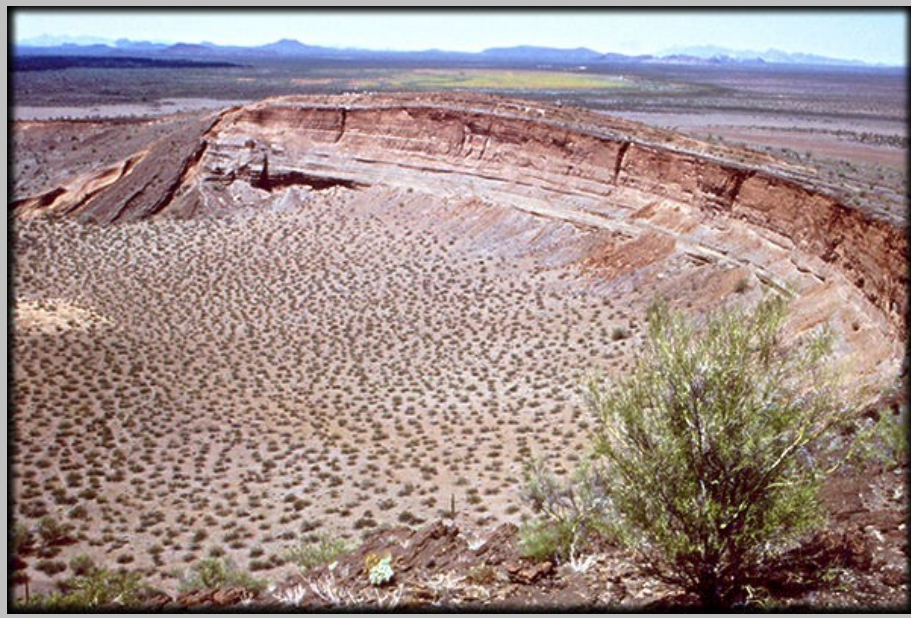
The inner north wall of Cerro Colorado . This structure is about one kilometer (3300 feet) in diameter, and about 110 meters (360 feet) deep. You can just barely make out our vehicles in this image. They are the small white dots, across the crater, along its rim. A dark lava flow can be seen in the distance.

Just across Arizona’s southern border, on the way to the Gulf of California, lies one of the Sonoran Desert’s most spectacular geologic features – the Pinacate Volcanic Field . Few of the many thousands of tourists that each year visit the party-place we call Rocky Point (Puerto Peñasco to the Mexicans) even know that it is there. That’s a good thing, too, for part of its beauty is its desolation. It is one of the most similar places to the surface of the Moon that you will find anywhere on Earth. Not because of its loneliness, though.