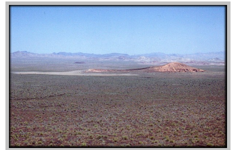
Cerro Colorado from the west.

Remember, and I’ve written about this in many other articles, that this part of North America is very active, geologically. Earth’s crust is and has been breaking up in this zone, and the fractures run deep. Molten rock can move upwards along those fractures, eventually making its way to the surface, hence the cinder cones and lava flows.