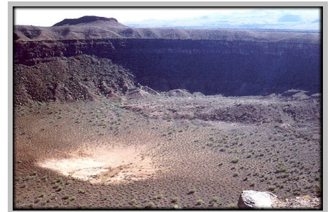
Crater Elegante is too wide to fit into one picture.

In the past, here in the Pinacate Field, some of that molten rock moved upwards, and encountered groundwater deposits (known as aquifers ). When it did, it converted the water instantaneously to steam – massive amounts of it – and the ground literally exploded outward, creating maars.