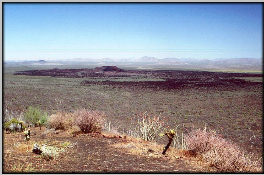
Basalt lava flows cover the Gran Desierto del Pinacate.

It is possible that humans witnessed some of the eruptions. Hohokam relics have been found along some of the erosion surfaces in the area. Studies show that the blasts occurred within the last few million years, and some only within the last few thousand years. Very jagged, black, and barren, the basalt lava formations that you drive by between the craters look like they flowed yesterday.